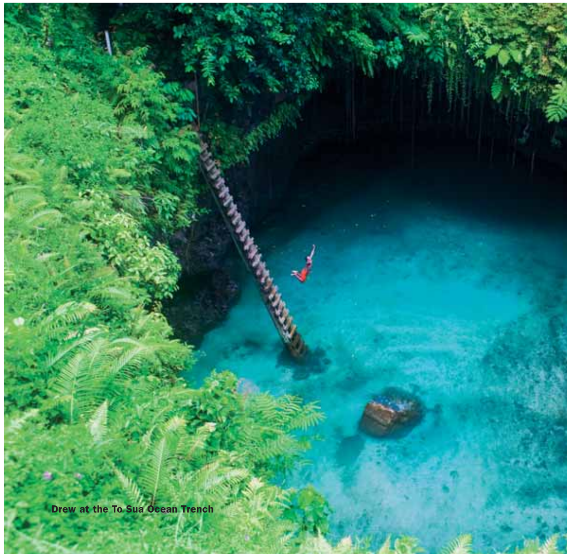
Drew at the To Sua Ocean Trench

Vanuatu is just three-and-a-half flying hours from Sydney, and was recently ranked by Lonely Planet as the happiest place on earth. The main island of Efate has a wide range of hotels and resorts, all of which are easily accessible from the airport.