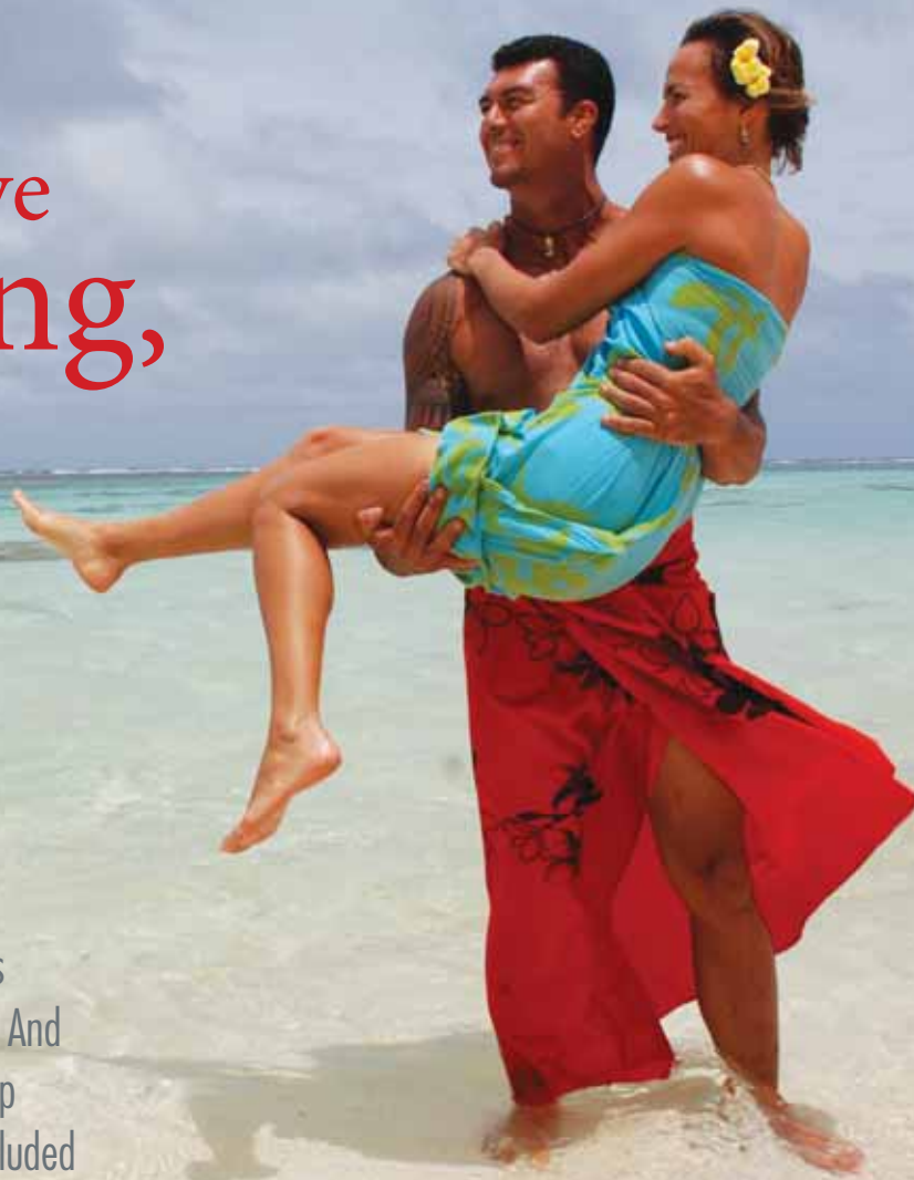
Cook Islands Tourism

Competition is tough between island holiday destinations bidding for a greater share of Aussie travellers' business. And agents are expected to benefit as tourism bodies ramp up marketing campaigns and more value-adds are being included in packages to increase sales.