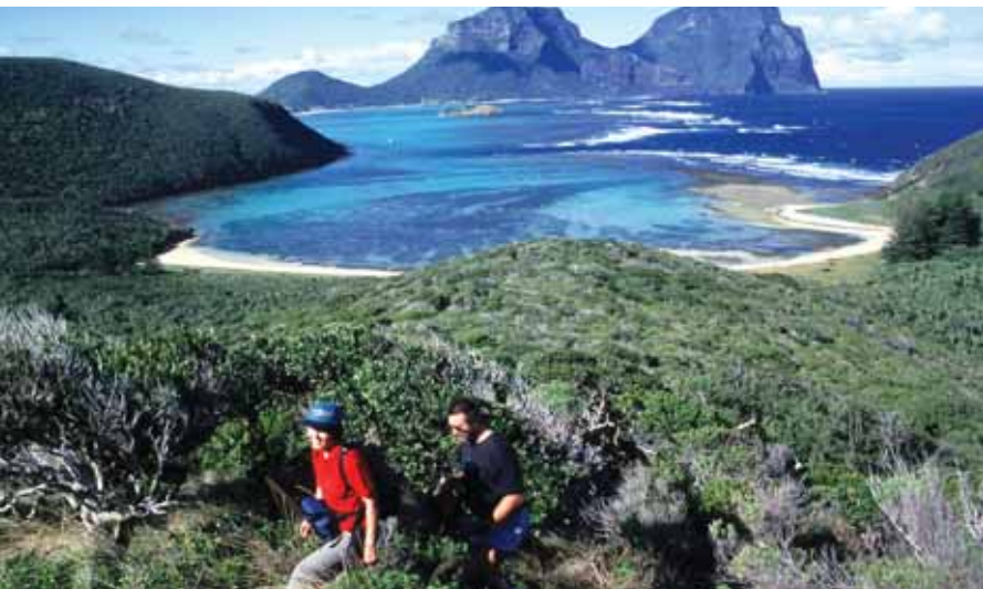
Walking, North Head, Lord Howe

The report said visitors were particularly impressed by the friendly, helpful and hospitable staff and friendly locals.