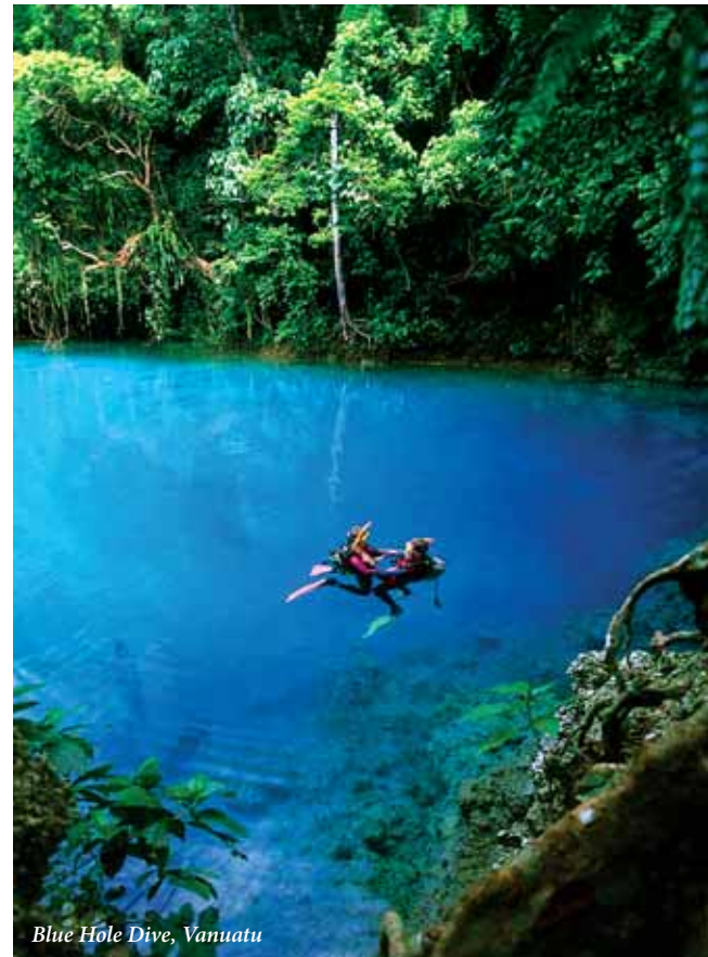
Blue Hole Dive, Vanuatu

Ditton said there had also been a steady stream of new hotels and resort developments. Much of this has been in the boutique market with small upscale properties or self contained accommodation which were proving popular with families and groups.