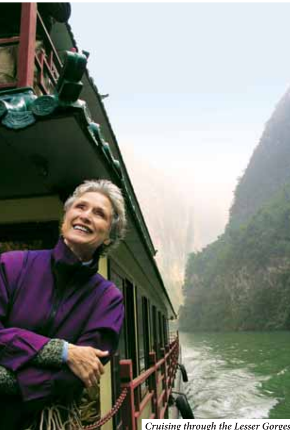
Cruising through the Lesser Gorges

VIKING River Cruises is introducing a new vessel into its China program in 2011, the Viking Emerald . Built to meet the demand for suites, it will begin sailing in March 2011. Viking Emerald replaces Viking Century Sun , and the company claims it is “the most deluxe ship sailing on the Yangtze River and one of the most sophisticated river ships in the world”. The vessel accommodates 264 passengers and has the largest suites in river cruising, including two presidential suites with wrap around balconies and separate sitting and sleeping areas, 14 suites, four junior suites and 132 deluxe staterooms.