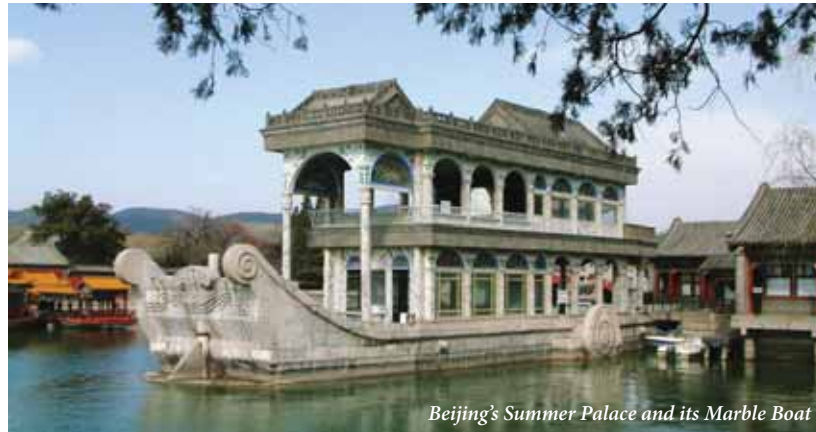
Beijing's Summer Palace and its Marble Boat

Tours run in November, February and March and are priced from $2450 per person (twin share) from Sydney, Melbourne or Brisbane, including departure taxes, security charges and fuel charges (subject to change).