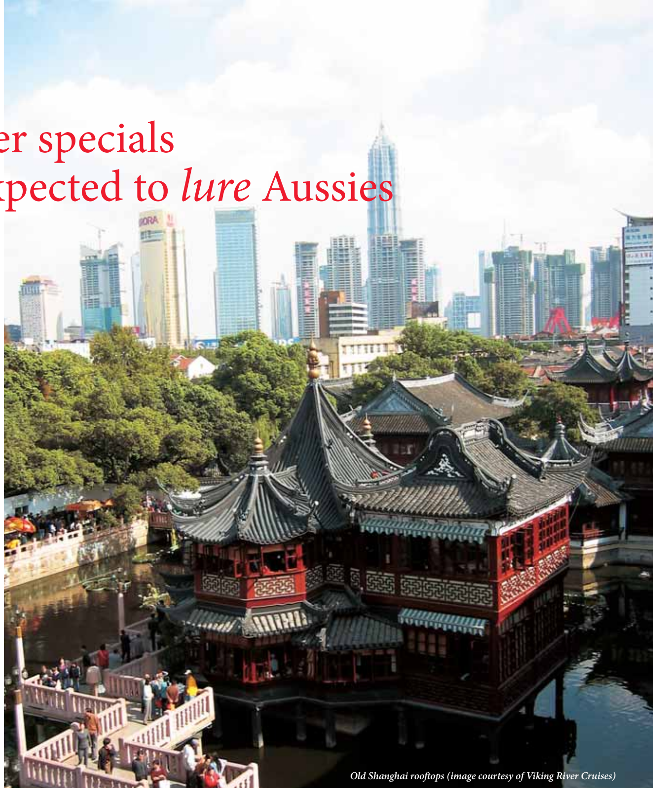
Old Shanghai rooftops

"China is appealing to Australia travellers for many reasons; it combines mystery, culture, history,