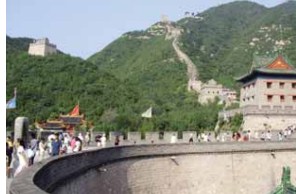
Great Wall, Beijing