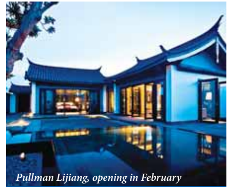
Pullman Lijiang, opening in February

There is also a 13-night "China Highlights" tour flying Air China that visits Beijing, Xian, Guilin, Longshen, Yangshuo, Hangzhou, Suzhou and Shanghai, priced from $2700 per person (twin share) departing on Boxing Day, and a seven-night "Christmas Jianguan" special that costs from $2870 per person (twin share) flying Qantas. It visits Shanghai, Suzhou, Yangzhou, Nanjing and Beijing, also departing on December 26.