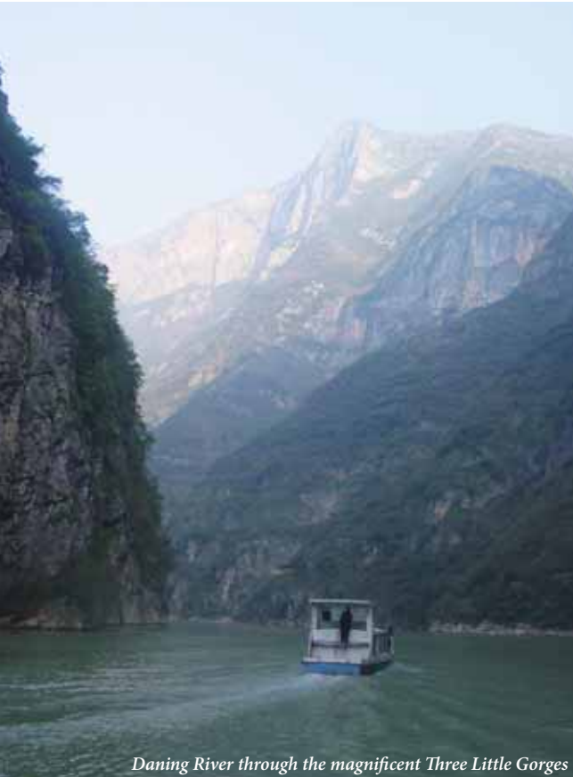
Daning River through the magnificent Three Little Gorges