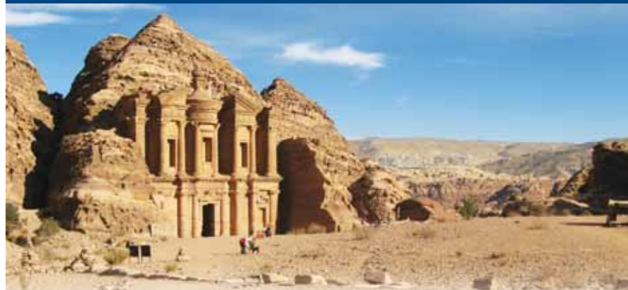
The Monastery, Petra, Jordan