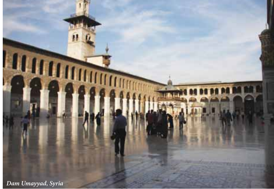
Dam Umayyad, Syria

"These riad-style boutique hotels offer a very high level of comfort and service and an atmospheric environment," he said.