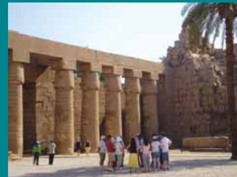
Great court of Karnak, Egypt

The 27 day "Majesty of Egypt – Magnificent