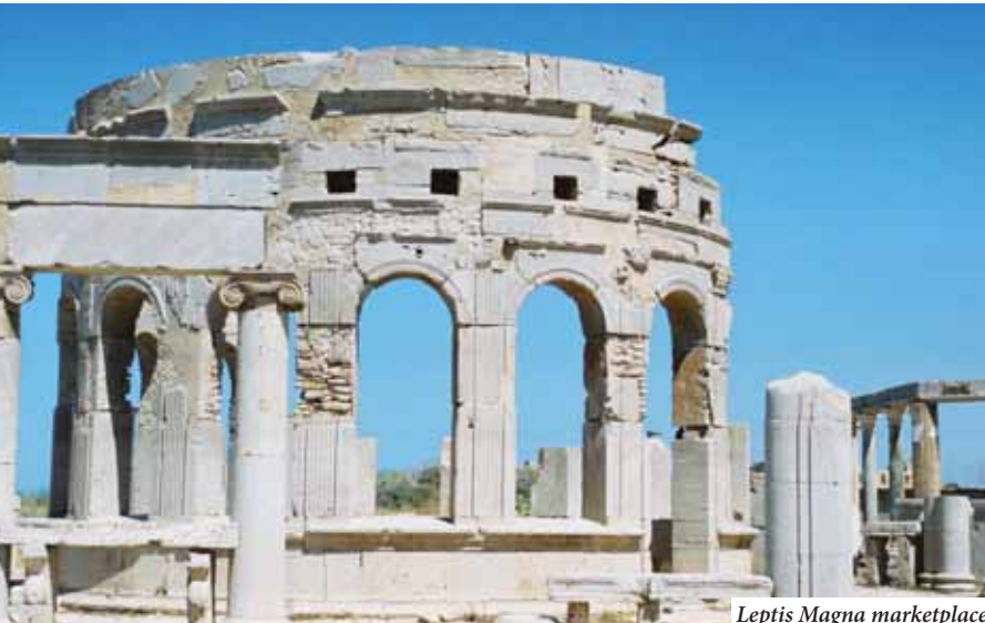
Leptis Magna marketplace