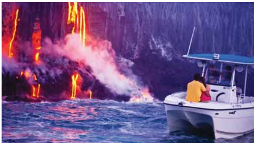
Couple watch magma stream into the ocean on Hawaii's Big Island

Maui and Ohau also offer a range less strenuous activities such as golf, and many activities are suitable for all ages and levels of fitness.