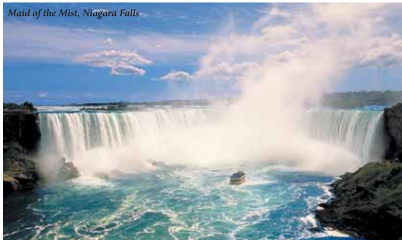
Maid of the Mist, Niagara Falls