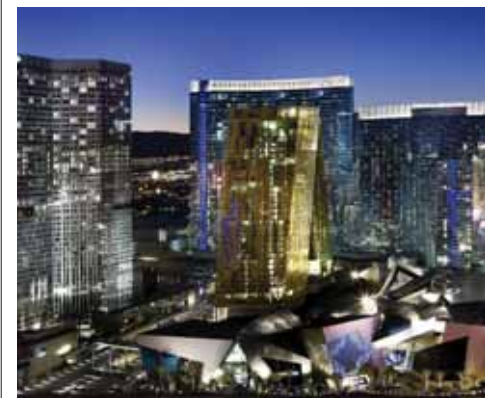
Aria Resort and Casino, Las Vegas

great demand, priced from $1385. It includes three-star accommodation, a seven-day New York pass which enables admission to more than 40 top attractions, a pass for the two-day hop on, hop off sightseeing tour and a helicopter tour over the Manhattan skyline. There's also the choice of either the "Manhattan Movie and TV" tour or the "Sex and the City" tour, a Macy's savings card and return airport transfers.