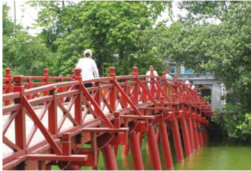
The Huc (Rising Sun) Bridge, Hanoi

It also includes a free stopover in Ho Chi Minh City or Hanoi, and is valid until November 18. The fare from Sydney is $1079 per person.