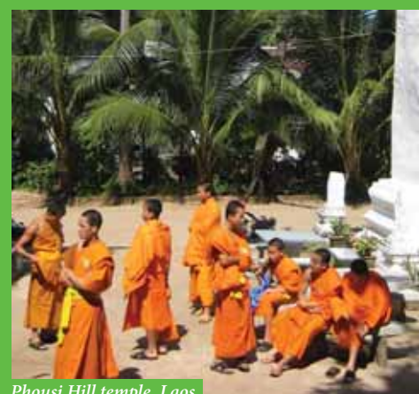
Phousi Hill temple, Laos

A complete range of tours is available. Wendy Wu's fully-inclusive group tours