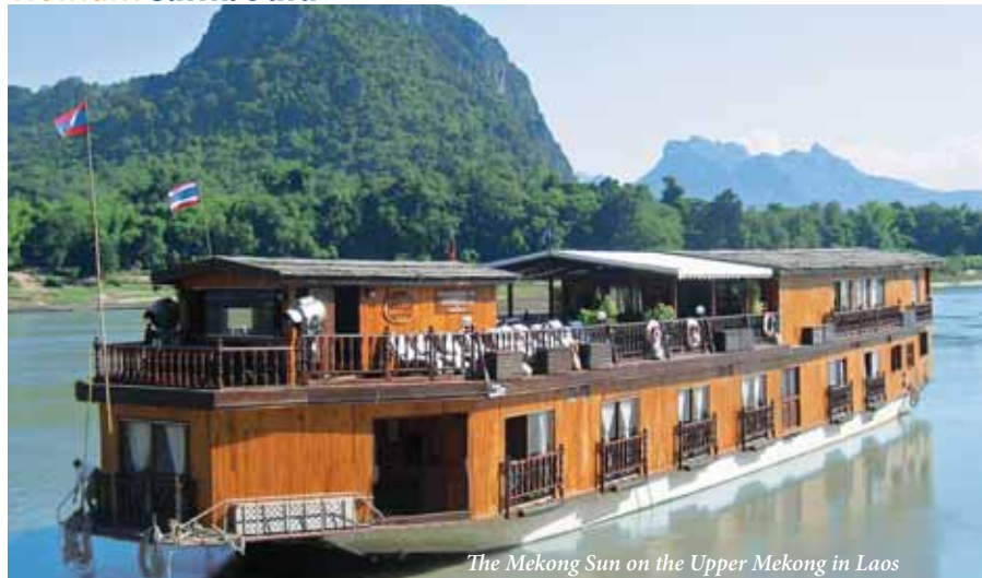
The Mekong Sun on the Upper Mekong in Laos