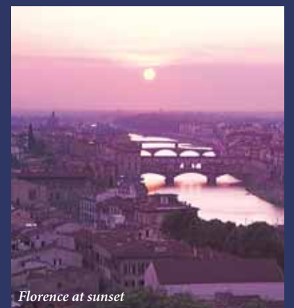
Florence at sunset

"Covering popular destinations such as London, Paris and Rome each Select itinerary includes an orientation tour in each city to help clients get their bearings before embarking on their choice of individual exploration or