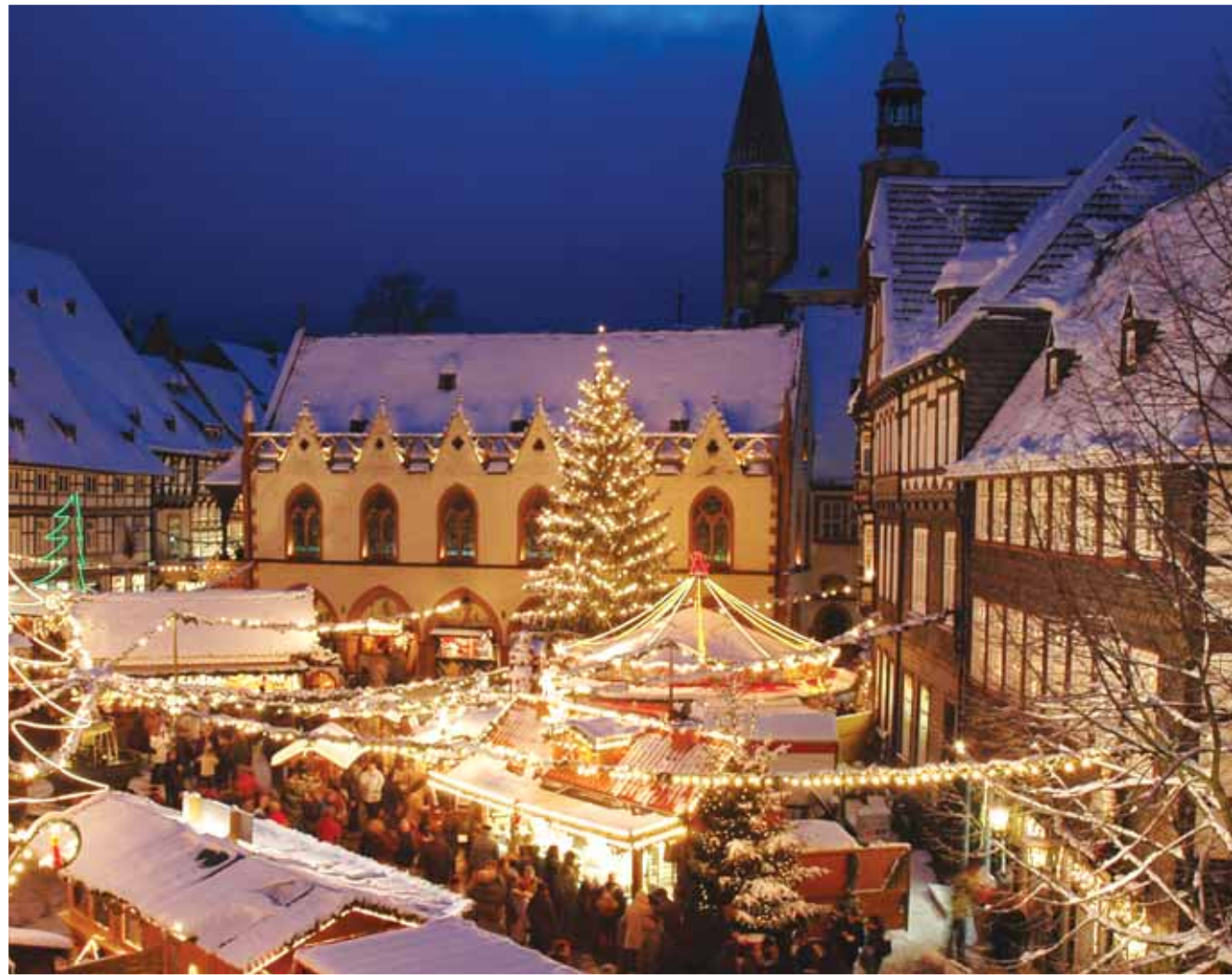
Mulled wine, roasted chestnuts and German Christmas markets are just part of the appeal of a European winter

"The weather is vastly different and Australians are certainly not used to a white Christmas, which is the case in