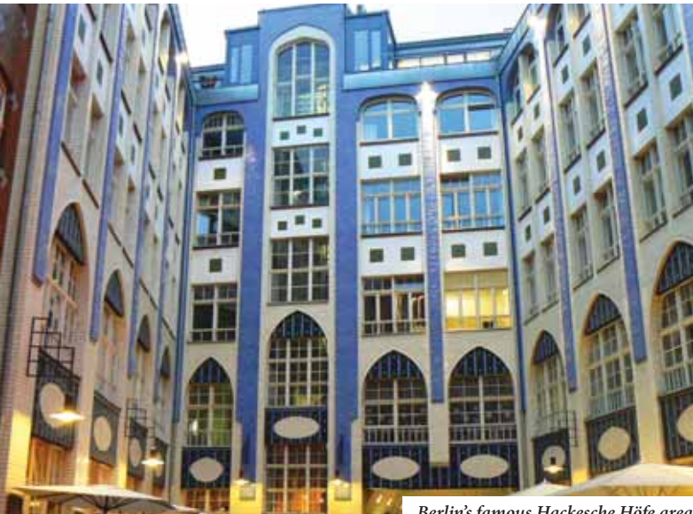
Berlin's famous Hackesche Höfe area

TOGA Hospitality will open two new properties in Europe in late 2010 and early 2011.