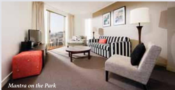
Mantra on the Park

Mantra says it is the “leading provider” of apartment-style