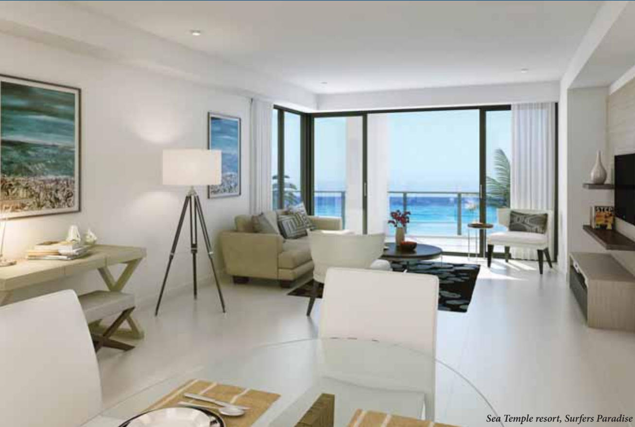
Sea Temple resort, Surfers Paradise

Strong business demand is driving hotel rates up in key CBD locations, while the leisure segment is only now showing signs of revving back up.