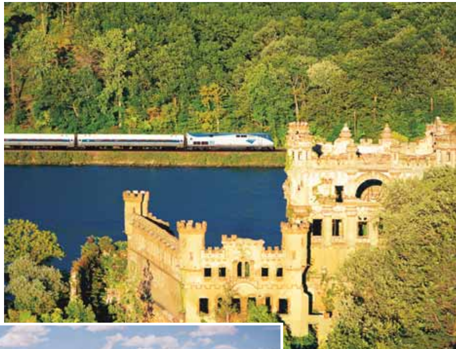
Above: Adirondack and left: California-Zephyr

Amtrak put its success down to a number of factors including high gasoline prices which have trended