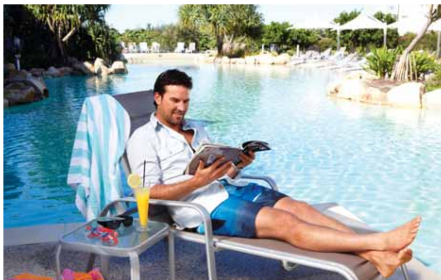
Pat Rafter relaxing by the pool at Mantra on Salt Beach, Kingscliff

In Sydney, Mantra 2 Bond Street is offering rates from $250 per night for a minimum two nights in an executive studio, on Thursday and Friday nights and Sunday and Monday nights until March 31, 2012.