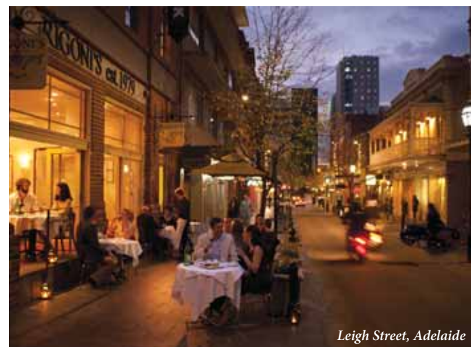
Leigh Street, Adelaide

Adelaide exhibitions and events over the coming months include the Saatchi Gallery in Adelaide exhibition of contemporary art from the acclaimed London gallery, at the Art Gallery of South Australia until October 23 and the Adelaide International Guitar Festival from November 25-28.