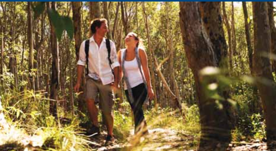
Bouddi National Park, Central Coast

QANTAS Holidays has launched a range of short break packages and add-on deals as part of its new "Experience More in NSW" campaign.