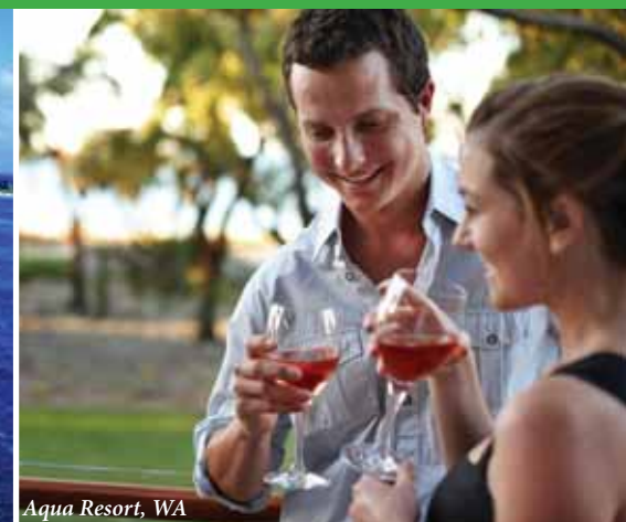
Aqua Resort, WA