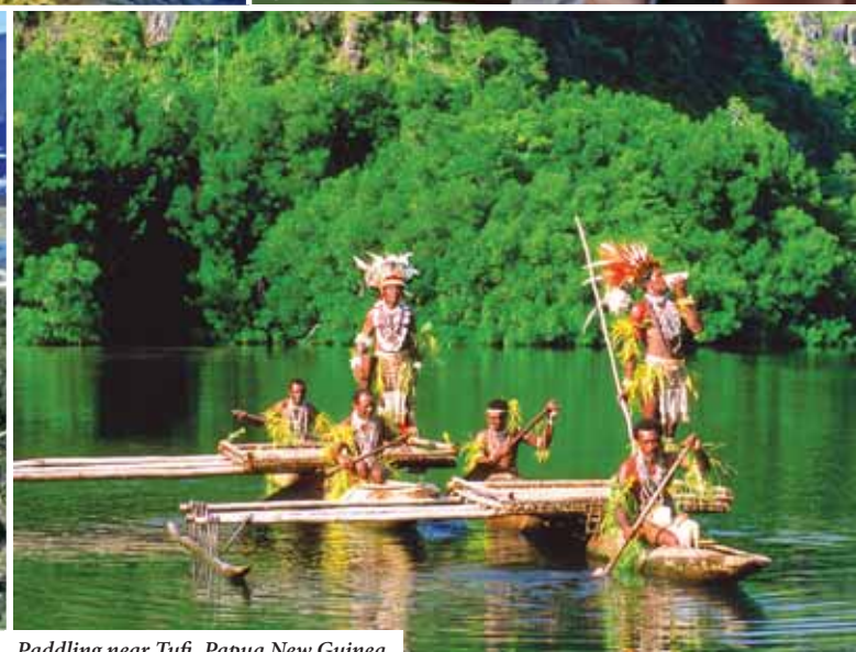
Paddling near Tufi, Papua New Guinea

in the current economic climate of low consumer confidence which is a great selling point for agents,” says Thornton. “They offer an alternative to a more expensive product that budget-conscious travellers’ wallets will like.