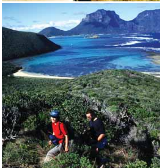
Lord Howe Island