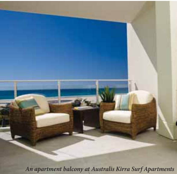
An apartment balcony at Australis Kirra Surf Apartments

AUSTRALIS Hotels, Resorts and Apartments has welcomed Australis Cairns Beach Resort and Australis Kirra Surf Apartments to its expanding network of hotels, resorts and apartments in popular coastal destinations.