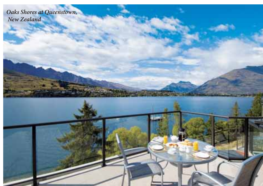
Oaks Shores at Queenstown, New Zealand

Rates at Aqua Resort start from $320 per night for a one-bedroom Grove Villa to $1080 per night for a five-bedroom villa. Two night minimum stays apply.