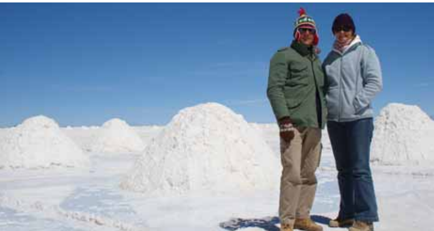
The Salar de Uyuni, a salt desert, in southwestern Bolivia

LATIN America specialist BFirst Travel says South America remains one of the least-known and least-explored areas of the world, making it a drawcard