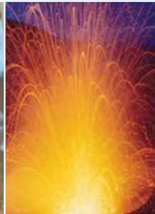
Vanuatu photos courtesy Kirkland photos

A short nonstop flight from Brisbane, Sydney or Melbourne aboard our new Boeing 737-800 takes you to a different world, with so much to see and do!