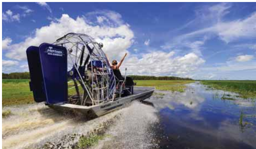
Airboating on Kakadu floodplains

The NT has reported a jump in the number of tourists visiting the