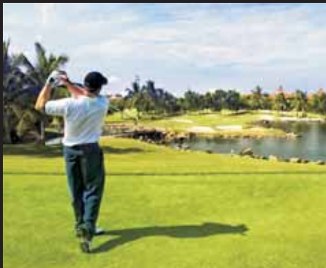
27-hole Championship Golf Course